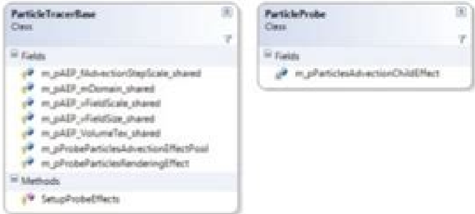
Figure 4.6: Shared shader variables and effect in the ParticleTracerBase , and the child advection effect in ParticleProbe

Every probe advects and renders its own particles. This requires it to manage the effects and shader variables needed for that itself.